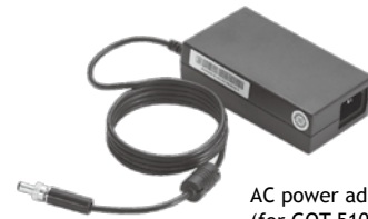
AC power adapter (for GOT-5100T-830-J)